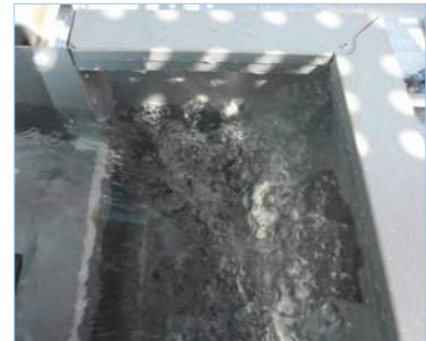
DB 200-1, Q = 16 l/s (box gutter slope - 1 in 200)